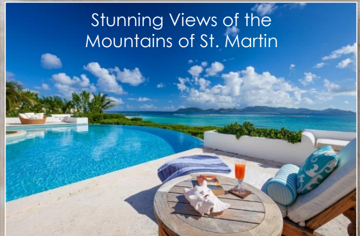
Stunning Views of the Mountains of St. Martin