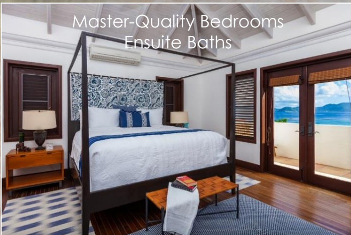
Master-Quality Bedrooms Ensuite Baths